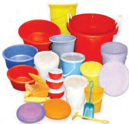
17.1 Plastic material