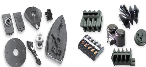
17.3 Thermosetting plastic